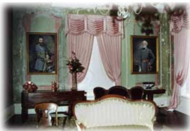
The Rose Parlor at beautiful Confederate Memorial Hall, the home and meeting place of Knoxville Chapter 89.

The UDC is the oldest patriotic organization in the United States. Its objectives are historical, benevolent, educational, memorial, and patriotic. We strive to honor the memory of those who served and fell in service to the Confederacy; to protect, preserve, and mark historic sites; to collect and preserve the truthful history of the War Between the states; to record the noble deeds of Southern women during and after the war; to fulfill the sacred duty of benevolence toward the survivors and toward those dependent on them; to assist descendants of veterans in securing an education; and to cultivate